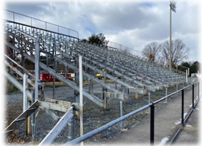
Removal of Home Bleachers as part of project demolition

As the project continues our goal is to communicate, the project's progress with periodic updates designed to capture important elements of major work performed.