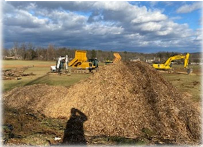
Clearing for New Draining Basin adjacent to Rt. 378

Construction has begun on two fronts with the kick-off of 2023. Our General Contractor, Athletic Fields of America (AFOA) in partnership with Shaw Sports Turf has begun excavation needed for detention basins to accommodate runoff and demolition of the home bleachers including the press box and handicapped section.